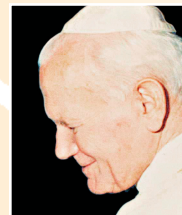
John Paul II, Evangelium Vitae

“When a parliamentary or social majority decrees that it is legal, at least under certain conditions, to kill unborn human life, is it not really making a ‘tyrannical’ decision with regard to the weakest and most defenseless of human beings?...In the case of an intrinsically unjust law, such as a law permitting abortion or euthanasia, it is therefore never licit to obey it, or to take part in a propaganda campaign in favour of such a law, or vote for it....The moral gravity of procured abortion is apparent in all its truth if we recognize we are dealing with murder.”